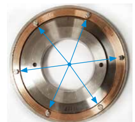
Fix the screws tightening torque of 3,4 Nm.